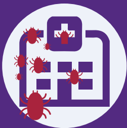
Poor infection control in hospitals and clinics