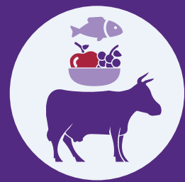
Over-use of antibiotics in livestock and fish farming