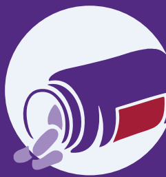
Patients not finishing their treatment