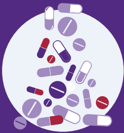
Over-prescribing of antibiotics

Antibiotic resistance happens when bacteria change and become resistant to the antibiotics used to treat the infections they cause.