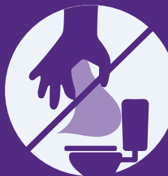
Lack of hygiene and poor sanitation