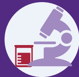
Lack of new antibiotics being developed